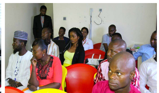
Cross section of participants at the event